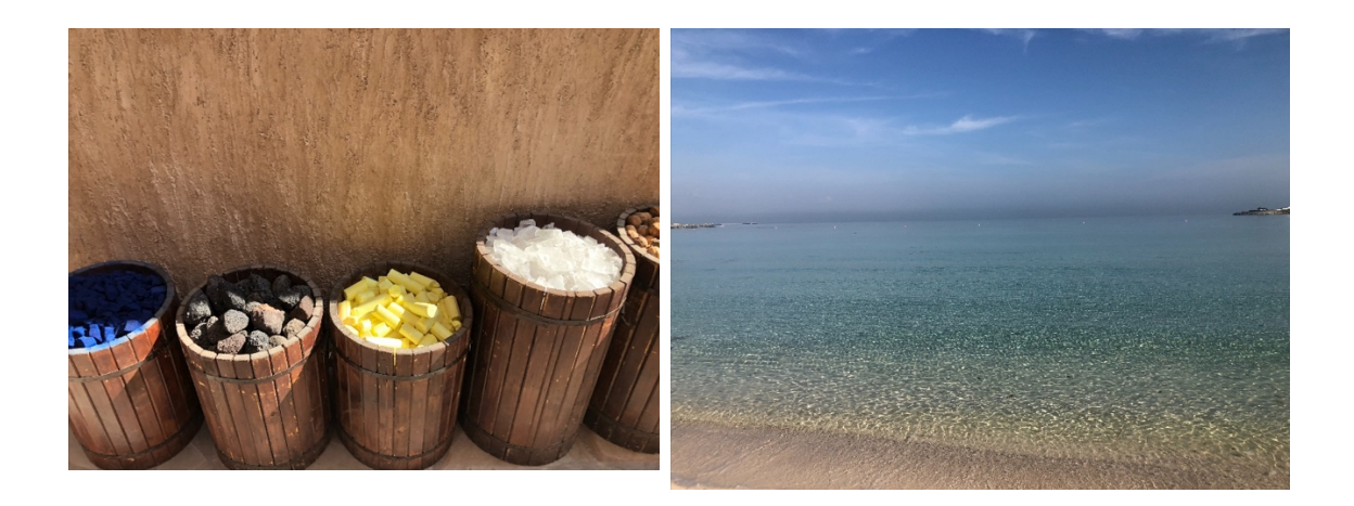
So where is Al Ruwais?